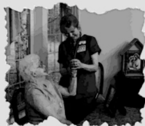
Family owned and operated setting Colonial Court apart from the rest.

Colonial Court Assisted Living With A Loving Touch