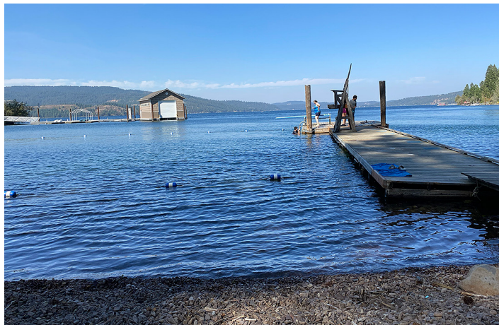
The swimming beach is in "The Cove" at N-Sid-Sen.

Camp sessions are led by approved and trained volun-