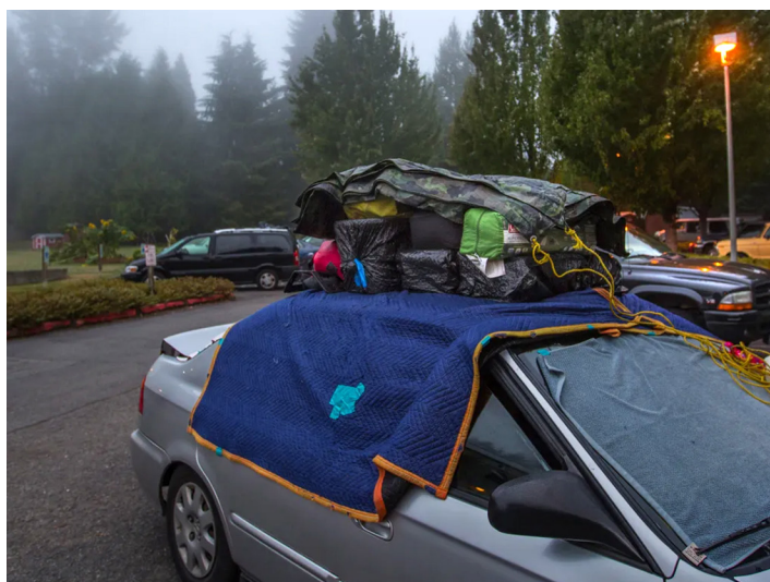
RV is being towed (top). Lake Washington UMC offers safe parking.