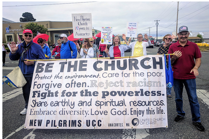
New Pilgrims UCC carried banner in Anacortes July 4 parade.

Its other outreach to the community has included A Simple Gesture Food Donation