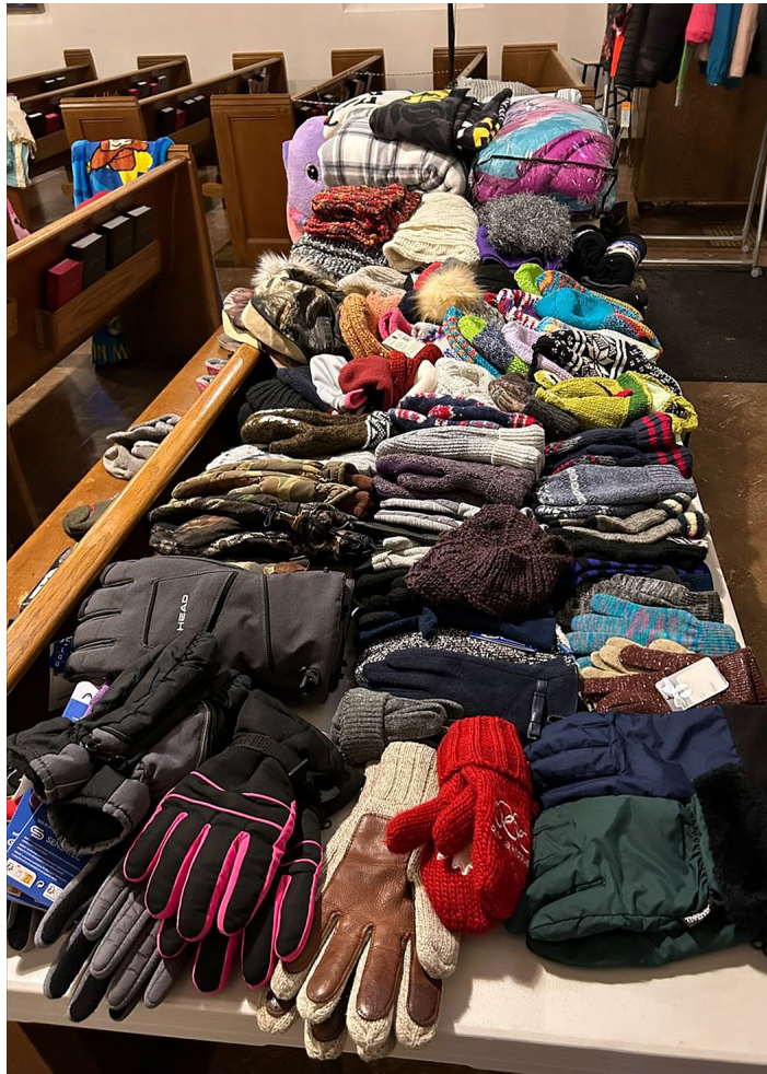
Warm gloves and hats fill a table at the back of the sanctuary.

Food Bank and Free Meal in mid November were also invited to "shop" for warm clothing items.