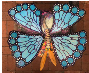
Hovering - toxins in gardens

A 1961 graduate of Union Theological School, he was ordained in the UCC, which