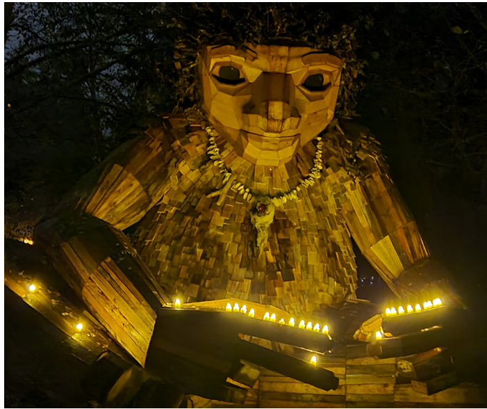
Pia the Peacekeeper is a gathering point in Bainbridge Island.