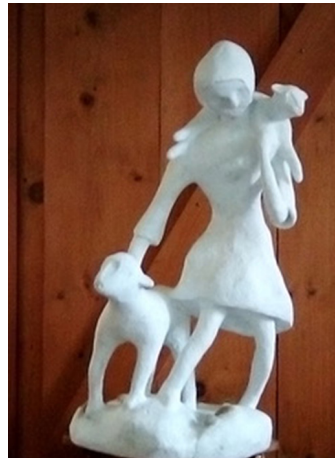
Finding the Lost

In his eight years of ministry there, he helped the church resettle about 100 refugees from Vietnam and Laos at first and later from Argentina and Ethiopia. He served during that time on the Washington State Commission for settling refugees, providing English classes and other training too settle in.