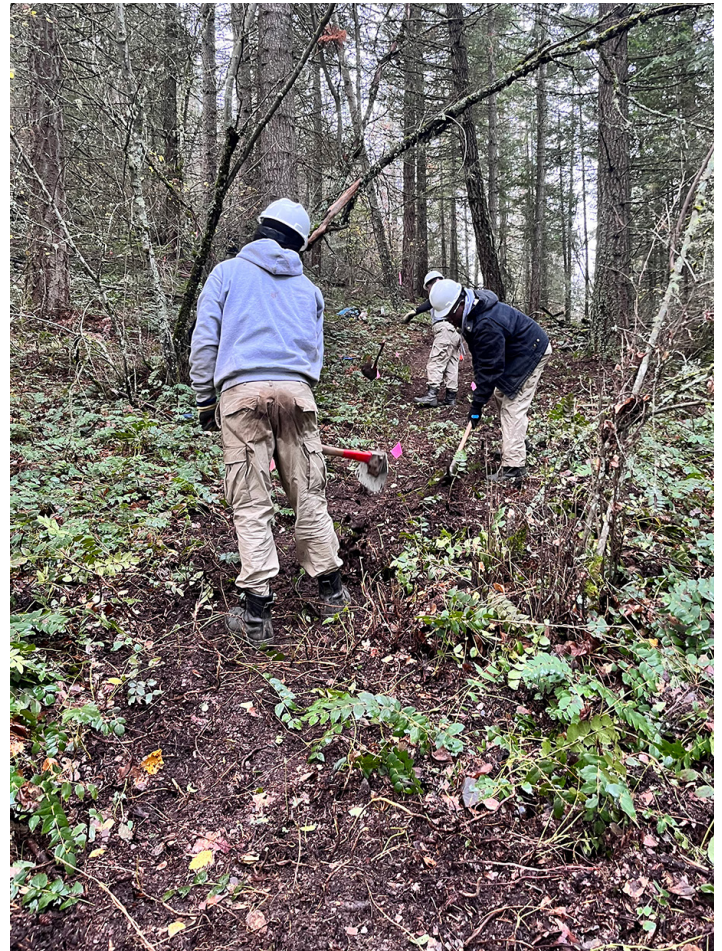
AmeriCorp team members clear trails at N-Sid-Sen.

In December they returned to Sacramento for two days before going to Eugene, Ore., where they will clear brush, make trails, and do beautification projects in parks for seven weeks, before going to Santa