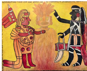
Spiritual and Other Leaders

“I’m still a member of University UCC, because after leaving the church, I served Overlake Presbyterian Church, a continuing Congregational Church in Shoreline, and as interim at Admiral in West Seattle, Renton and Sunnyslope in Wenatchee,” he said.