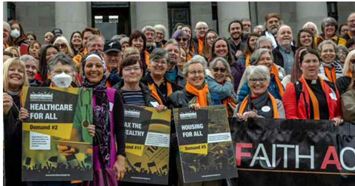
Faith Action Network Advocacy Day is Feb. 8 at Olympia,

"We advocate for policies that advance our values grounded in faith and spirituality: belonging and human dignity, justice and equity, interconnectedness, collaboration and pluralism," she said.