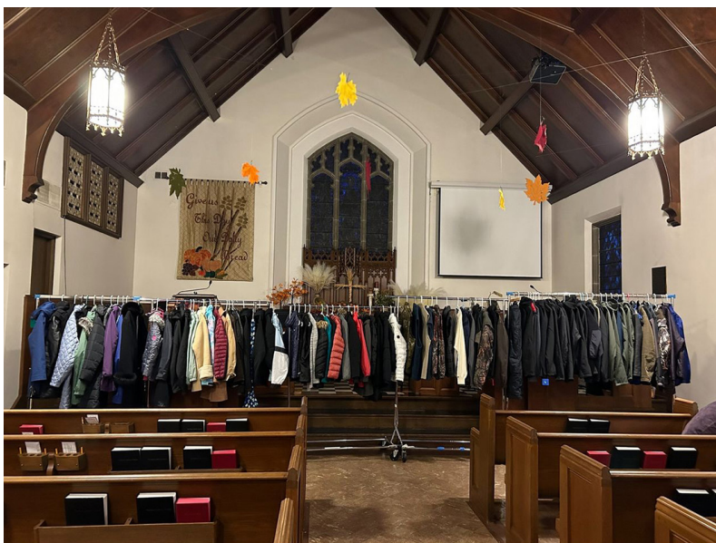
A rack of winter jackets spans the width of the sanctuary offering a wide selection for adults in need.

For information, call 425-333-4254, email tolt@toltucc.org or visit toltucc.org .