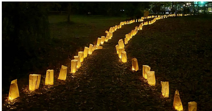
Luminaria line the path to Pia the Peacemaker for vigil.