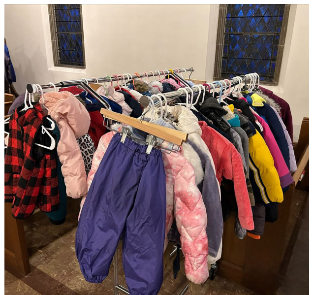
Two racks of children's winter coats and snow pants are set up for those at the food bank to choose from.