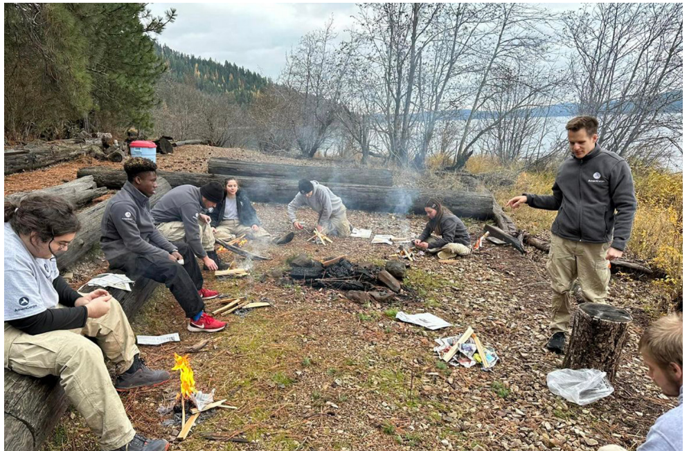
Eight of the nine AmeriCorps team helping with fire mitigation, trail clearing and beautification at N-Sid-Sen enjoy a campfire.

“At N-Sid-Sen, fire mitigation has Continued on page 4