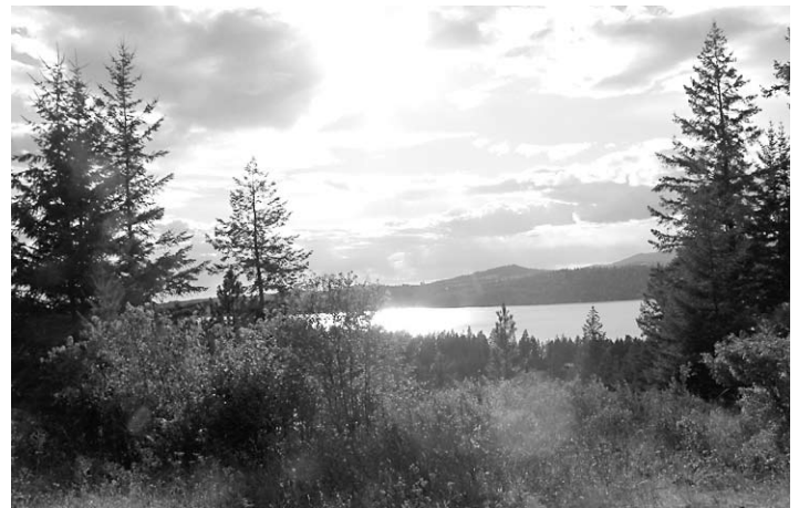
Inspiration Point is the goal of many hikes at N-Sid-Sen.