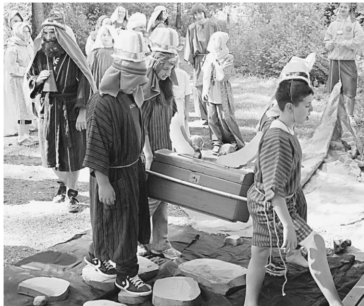
Intermediate campers act out Hebrews crossing Jordan.

For information, call 208-689-3489 or 360-879-2031.