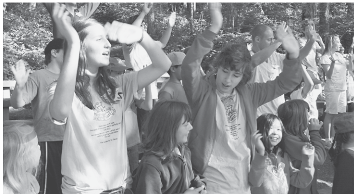
Enthusiasm at camp requires involvement in congregations.

"The churches own the camps," Deeg told them.