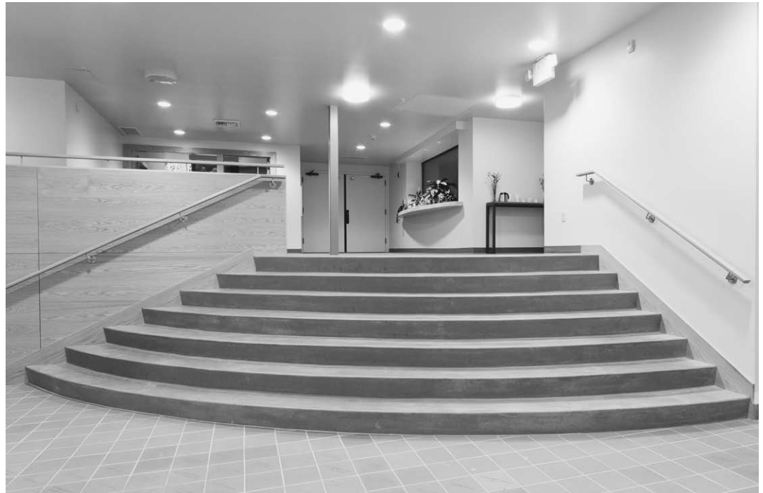
New entry to Fauntleroy UCC opens up foyer so YMCA office is visible. Signs will be added.

In the new building, the two share spaces for children's activities and a multiuse place used for pilates classes for the Y and a music room for the