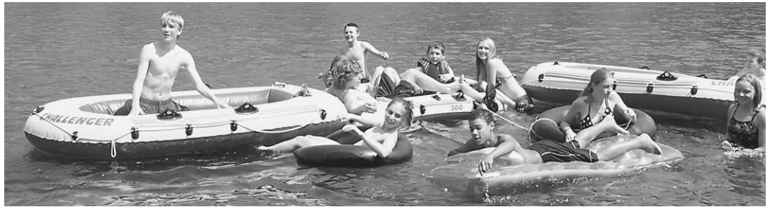
Junior high youth float on the St. Joe River, a traditional part of aqua camps.