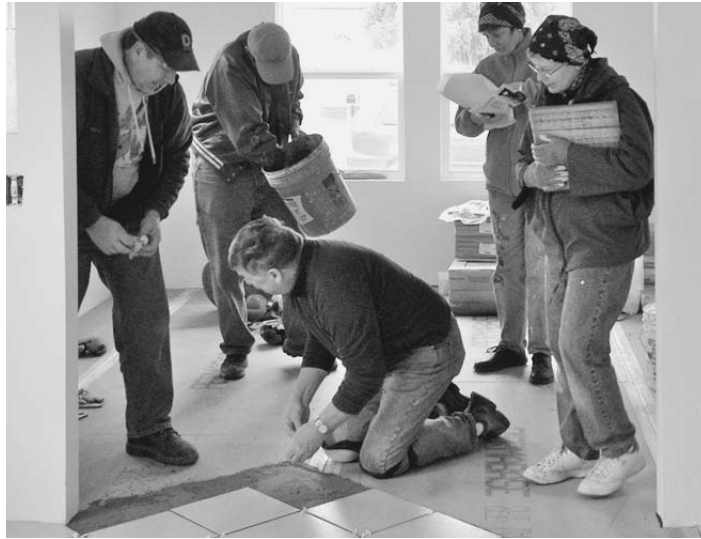
February team each has roles in laying tile flooring.

“I see hope and I see progress,” she said, adding that some federal stimulus funds will help rebuild the roads. “I continually hear stories and experience gratitude. A 50-member gospel choir that was rehearsing at a church gave us a standing ovation and had tears in their eyes. Our emotional connection is strong.