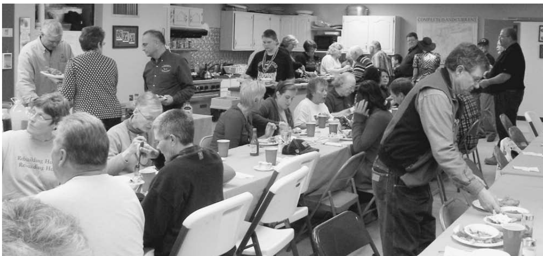
Monday potlucks provided by Little Farms UCC, which hosts the teams, build community.