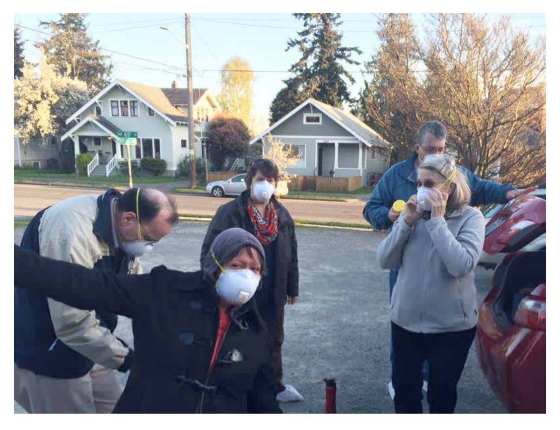
Members of St. Paul UCC put on face masks for protection from asbestos released by the fire.