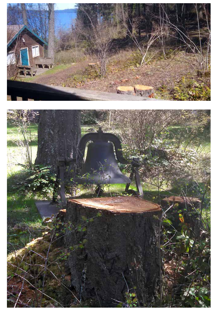
Open view from a cabin to the lake and a stump by the bell.

The Coeur d'Alene River is a Superfund Cleanup Site. The Coeur d'Alene Tribe and the Kootenai Alliance are working with the Environmental Protection Agency, with the Idaho Department of Lands, the Idaho