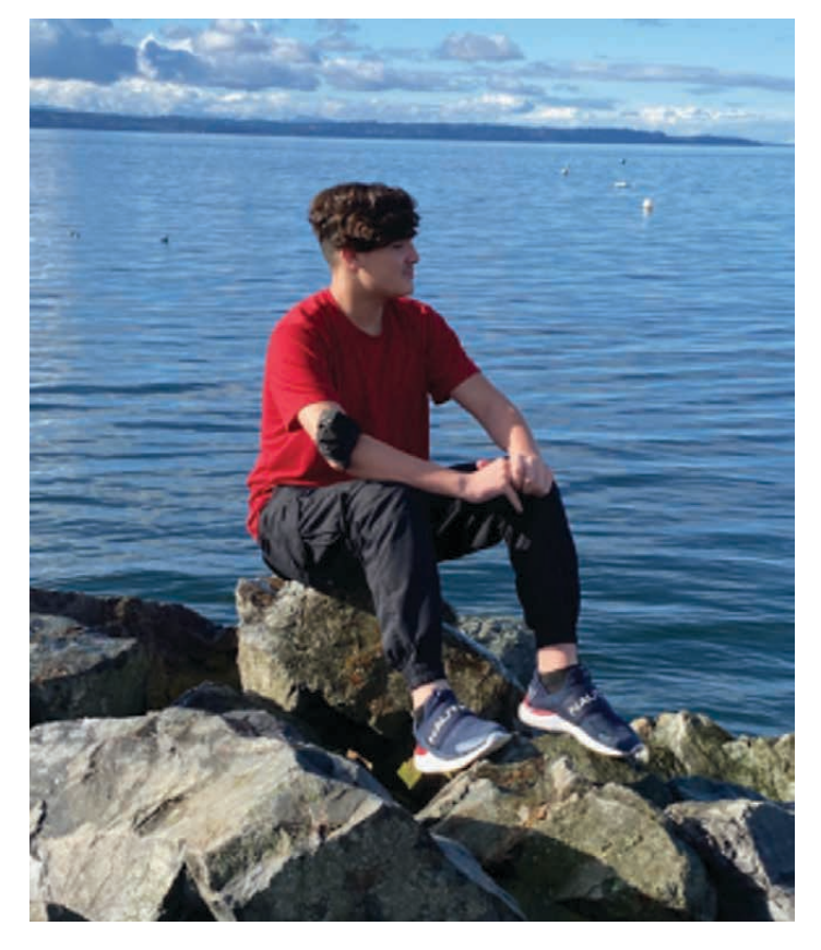
Oldest son appreciates view of Puget Sound.

from ages two to 19-is from the northeast province of Badakhashan. The father served for