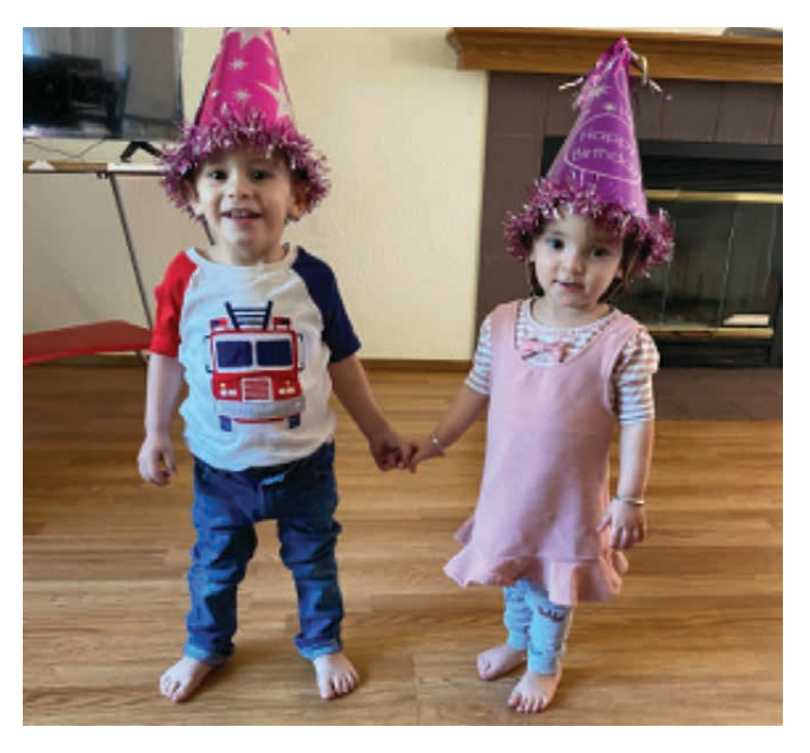
Afghan refugee twins celebrate their second birthday

The family of 10-two parents, four boys and four girls