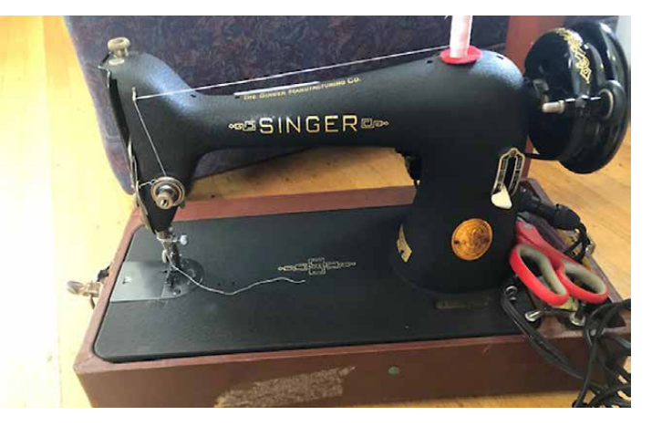
Volunteers found sewing machine used by Irish immigrant.

"We began talking with each other as the national UCC was encouraging churches help