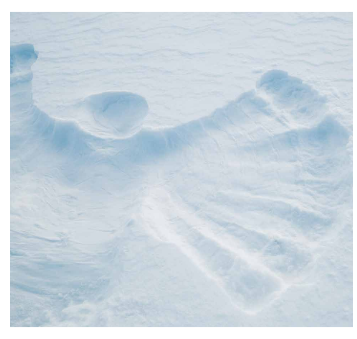
Lenten snow angel sets theme for stories of hope.

Time away from my paper, a warm cottage pie, and encouraging words from my room-