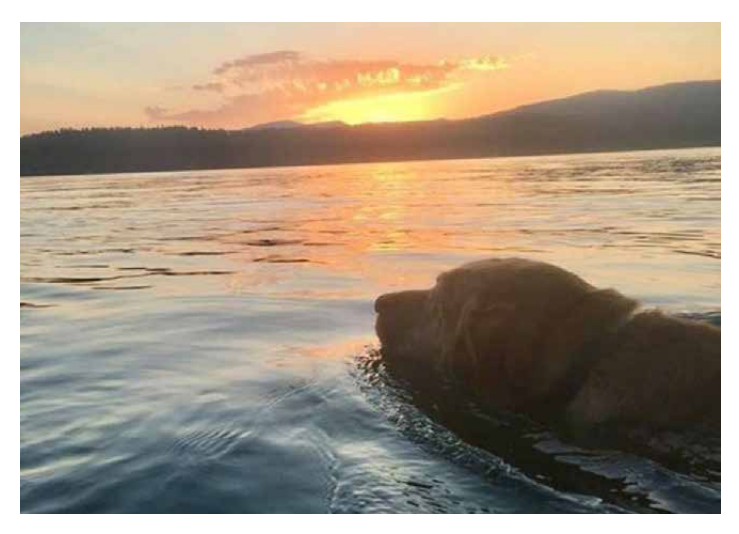
The camp dog, Sage, swims in the sunset at N-Sid-Sen.

'Campers and leaders live, work, play and worship from