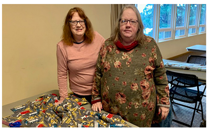
Group removes invasive plants at Thorndike Park, top. Other volunteers help with the Project Linus blanket project.