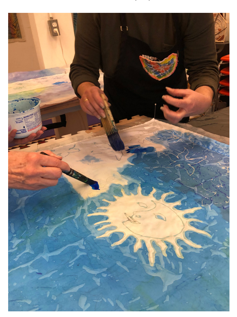
Gathering Ground group makes a banner.

heart that involves sharing and listening to stories," she said.