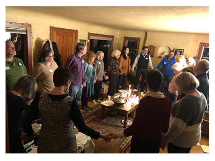
Closing circle ends Winter Solstice celebration.