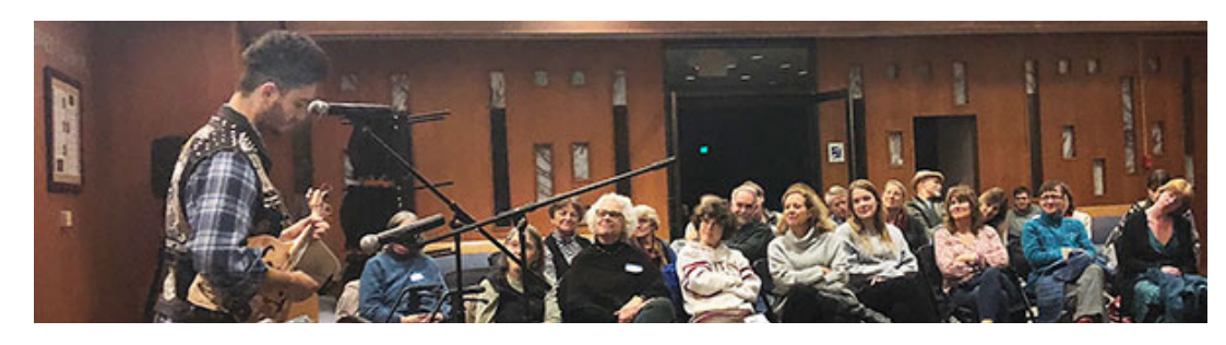
Gathering Ground group gathers for a time of story sharing and singing in 2018.

University Congregational UCC "planted" Gathering Ground, and the conference