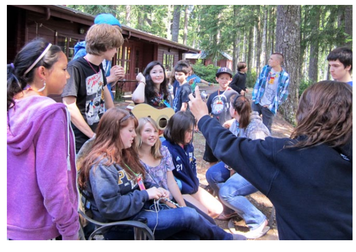
Intermediate campers often sang in free time outside the lodge.

"At camp, we serve meals family style. Many young people have no idea of what it means to sit down to eat a meal together as a family. Many eat in front of TV or in a car going