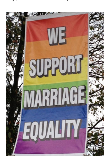
Many UCC churches hung banners declaring their stand.

"Our support was framed as coming out of our faith and beliefs," she said. "There are