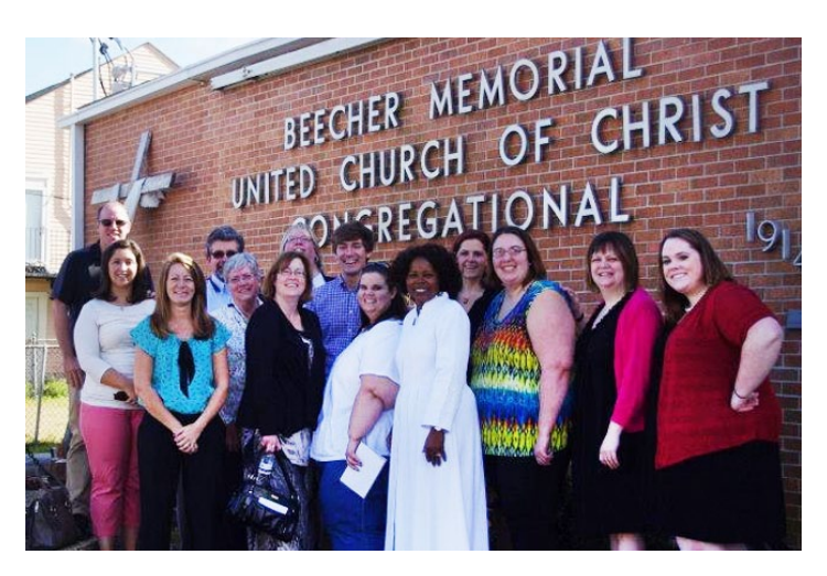
Network of Wider Church Youth Ministries gathering in New Orleans.

"Gathering with others around the UCC, we shared ideas and resources for our work with youth and young