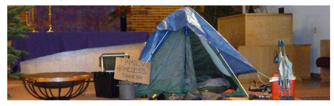
For Advent, Alki set up a tent on their chancel instead of a traditional manger scene.

One avenue for communicating about family homeless-