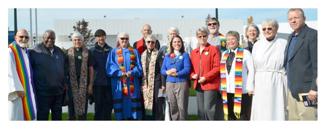
Four UCC and 11 other Spokane clergy joined in an ecumenical "Love Rally," and a billboard photo.

UCC churches participated in phone banks, holding cof-