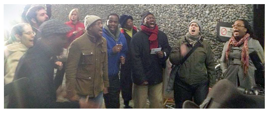
Liberation UCC choir sings at King County Recorders Office on Dec. 6.

On Thursday, Dec. 6, the first day when same-sex couples could file for marriage licenses at 39 county courthouses throughout Washing-