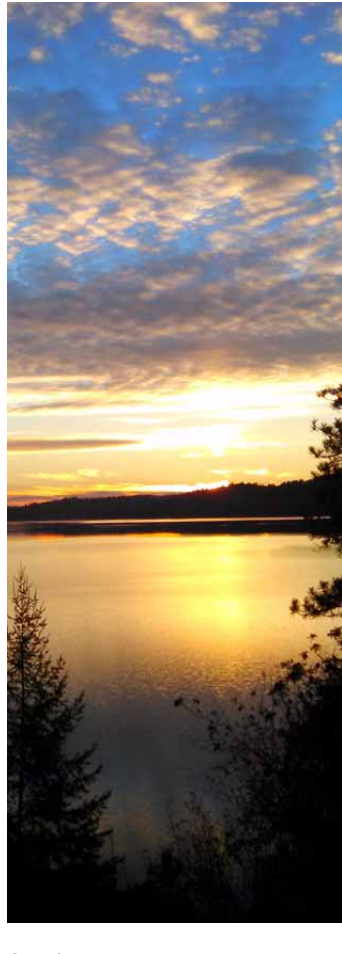
Another sunset.

Family Camp #2 - Aug. 9 to 15 For information, call 208-689-3489 or visit n-sid-sen.org.