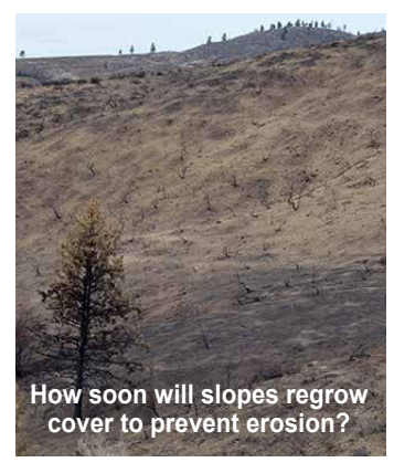
Some areas became moonscapes (top). Others were untouched (below).

Vera, who lived in Pateros six years before the 2014 fire, visited a neighbor last year. "Everywhere I looked was black, so I took her a pot