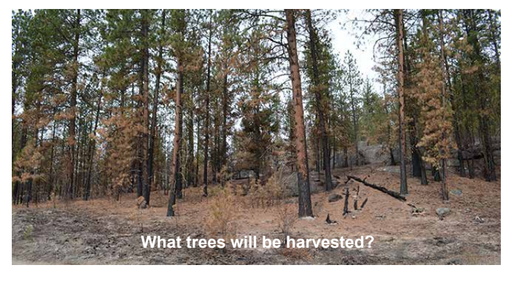
Some areas burned out (below), others were scorched (top).

Governor Jay Inslee's request for assistance said 522,920 acres were burned in the Okanogan Complex, Tunk Block and North Star fires (Okanogan Complex), com-