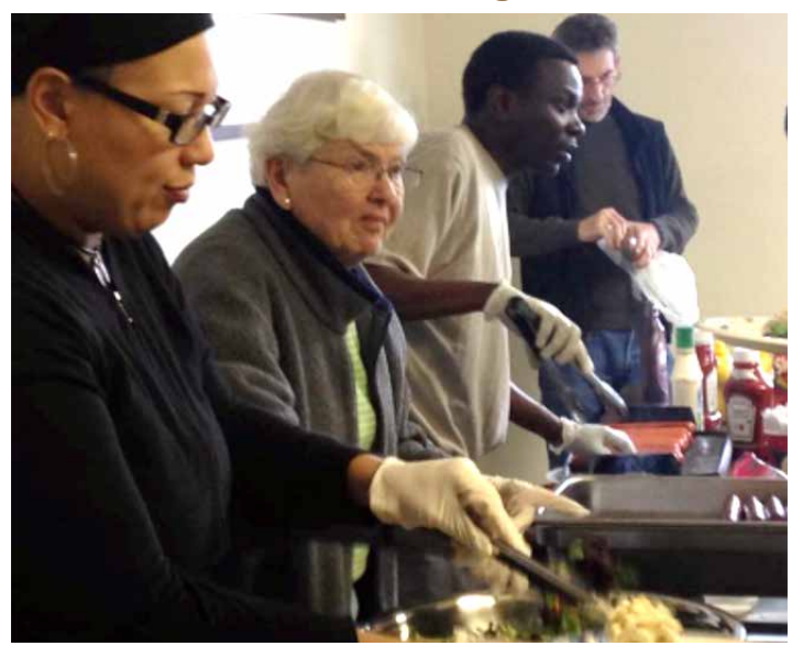
REACH volunteers serve supper to homeless people.

Latter-day Saints missionaries cook hotcakes for Warmup