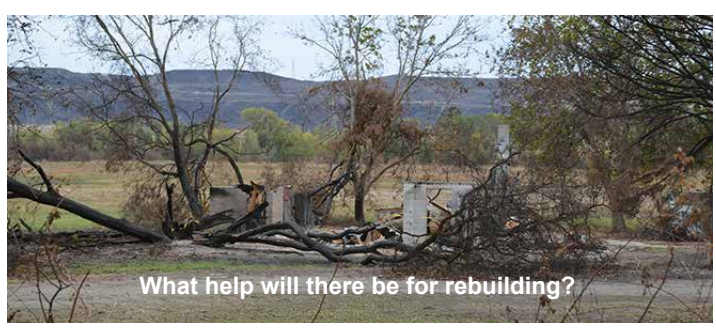
Some homes burned (above and below), others were surrounded and survived (right).