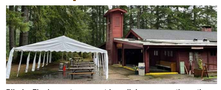
Pilgrim Firs has set up an outdoor dining area on the patio.