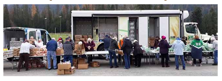
Church volunteers feed people in northern Stevens County.