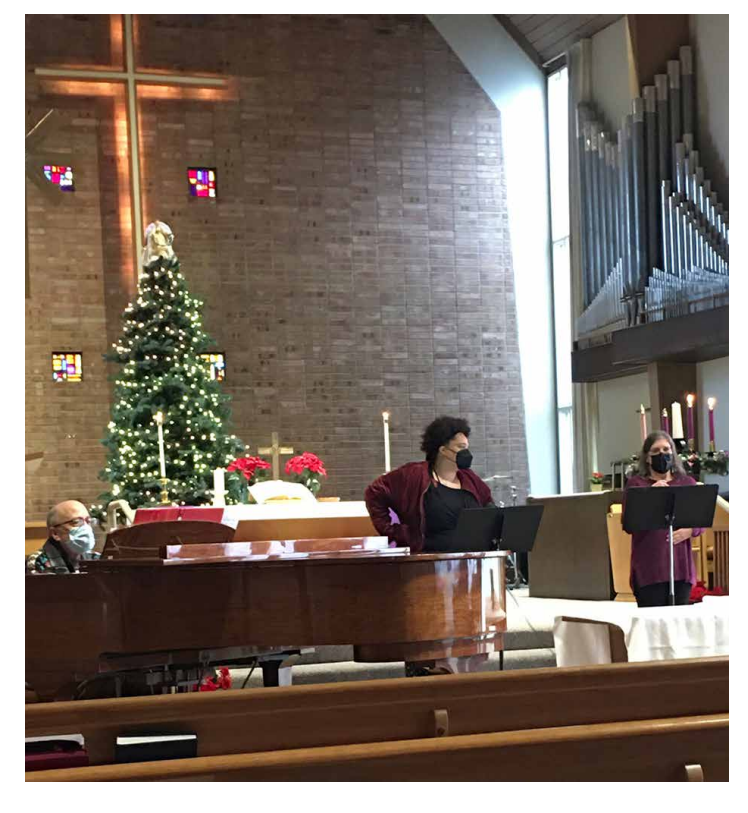
Worshiping in person began in mid June. Photo shows Everett UCC worship leaders on the second Sunday of Advent.

Everett UCC also has a small "pantry" open on the last