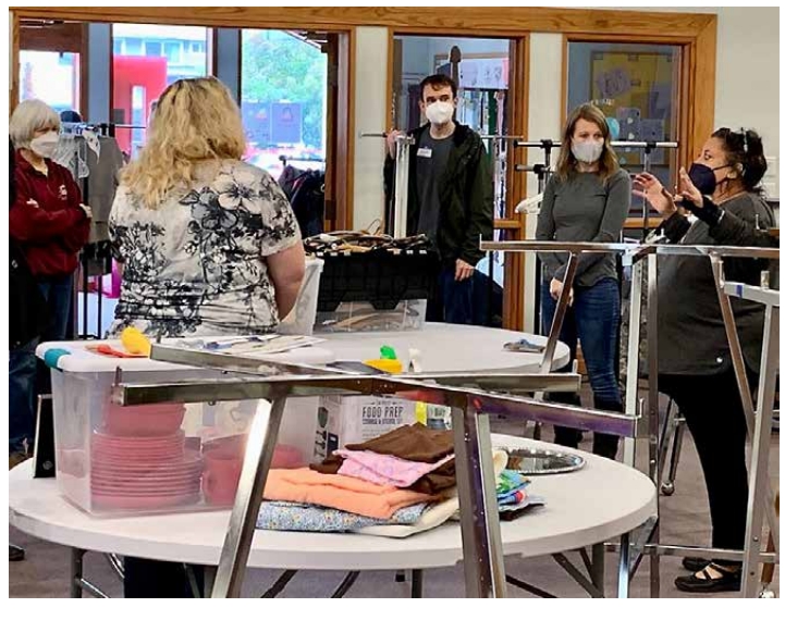
Volunteers set up clothing bank for Afghan refugees and others.