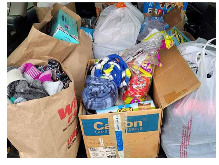
Food is brought to Chewelah from Hope Street Project in Colville.

They are also renovating buildings for housing, and some of their clients assist in the work, she said.