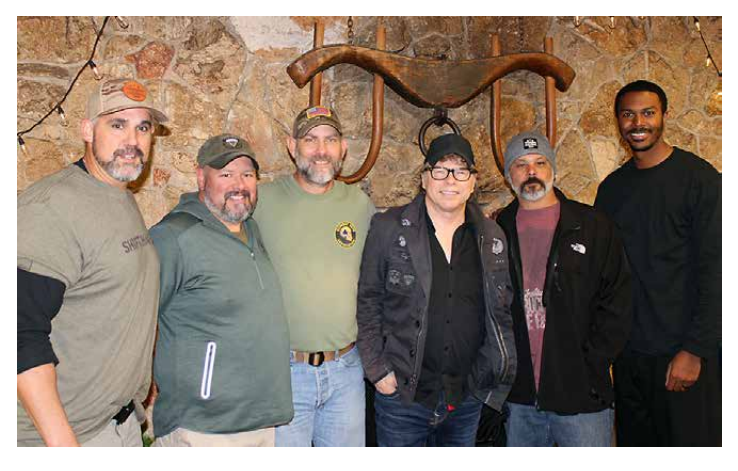
Warrior PATHH group at Pilgrim Firs joins in song writing.

"These programs use a unique blend of wellness prac-