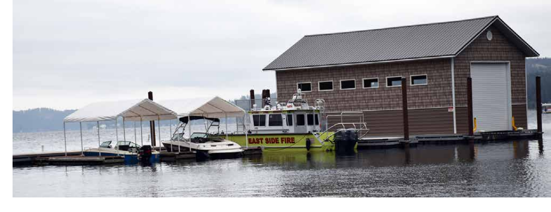
N-Sid-Sen fireboat and fireboat house is now an established part of the scene in the cove.

For information, call 208-689-3489 or visit www.n-sidsen.org.