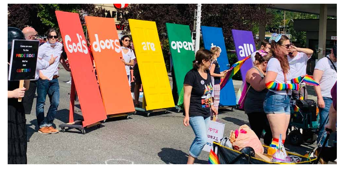
Renton United Christian Church members walk with doors in River Days Parade July 27.

Members of the UCCs ecumenical partner, the Christian Church (Disciples of Christ), took social-justice actions at their July General Assembly similar to those taken a month earlier by the UCC General Synod on global migration,