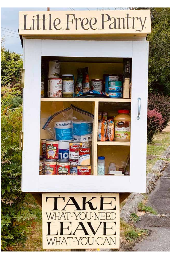
Free Little Pantry is yet another community outreach.

private prisons, interreligious relations, plastic use, energy innovation, denouncing hate,