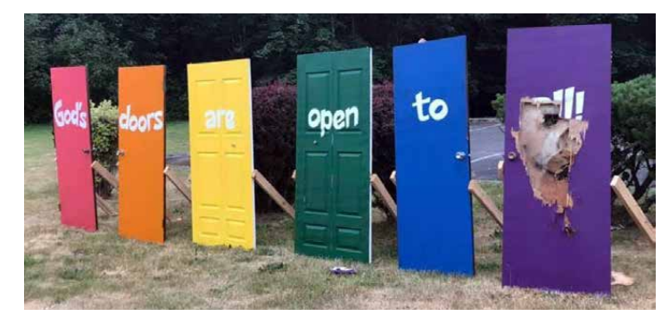
Door with "all" damaged. Other doors damaged later.