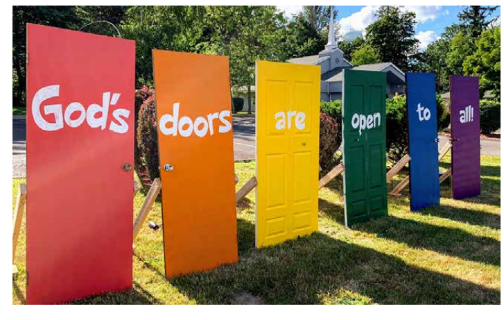
Church set up display of "God's Doors" in their yard.

The vandalism led to an outpouring of prayer and support, so the church, with atten-