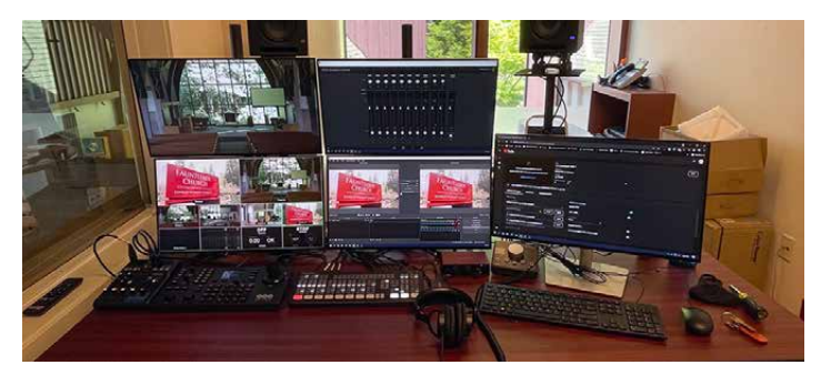
Fauntleroy tech room.

To include children, who were not vaccinated, they decided to offer Sunday school outside for an hour with all ages together.