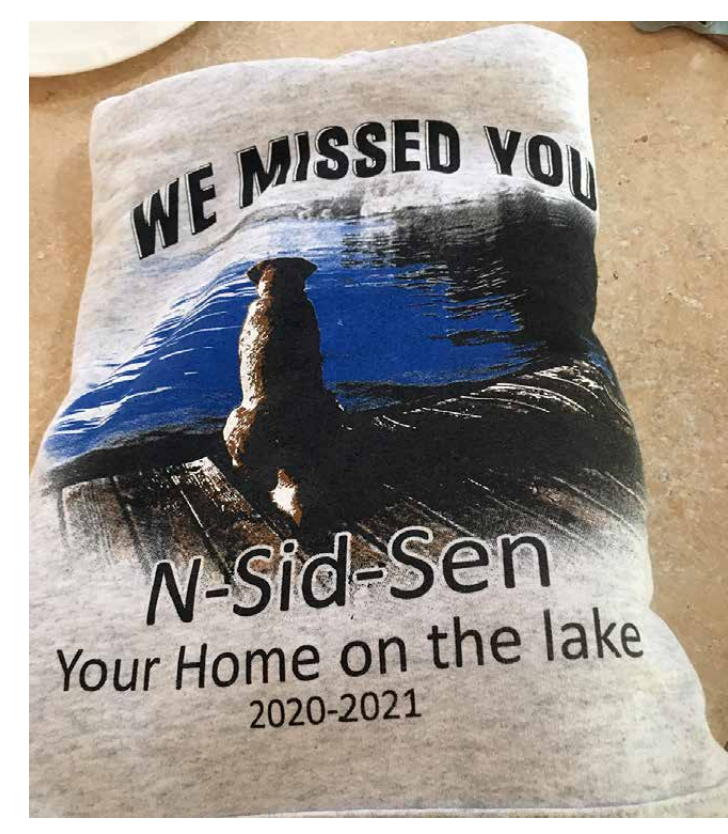
N-Sid-Sen sweatshirt design let people know they were missed.

They spread out in the lodges and cabins. They were