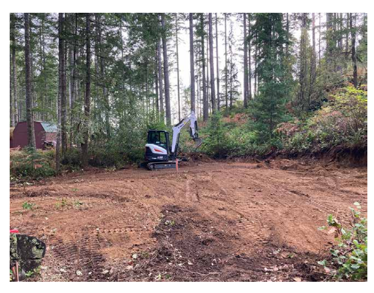
Top: Work is underway to enlarge the labyrinth at Pilgrim Firs. Below: Raised beds are being filled in the Pride Garden.

Those communities include the PNC churches, guitar camp groups, the stone sculpture