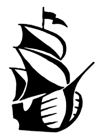
The church's new logo.

Instead of the church having long-term committee commitments, members join in three-month mission, envi-