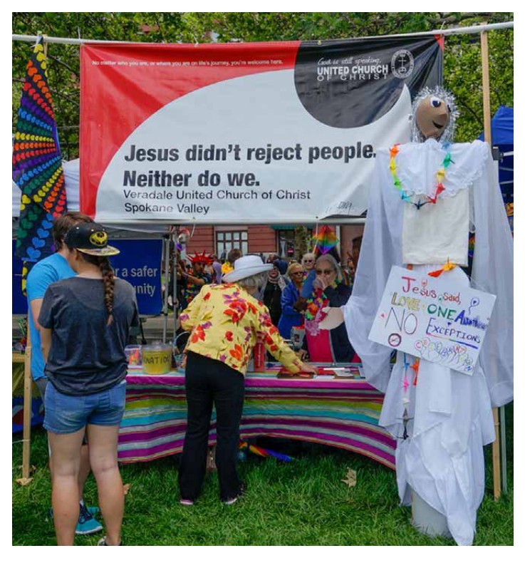
Veradale UCC booth offers message of inclusion.

"I was terrified. I didn't make eye contact with anyone, afraid I might see someone I knew," Jan said. "Most people don't realize what LGBTQ people go through when they go to the parade. We fear bombs,