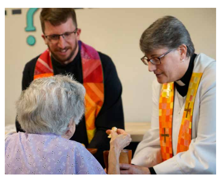
Pastors serve communion at the Pride Service.

hate groups and people yelling nasty things. That happens every year. Many overcome that fear by being brash."