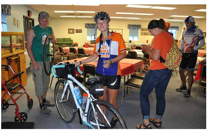
Bicyclists stayed overnight at Newport UCC last summer.

"It was a bit of a stretch for some folks to have bicyclists