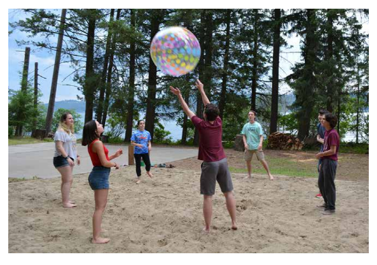
Campers play beachball volleyball at N-Sid-Sen.

For information, call 208-689-3489 email mark@n-sid-sen.org register at n-sid-sen.org