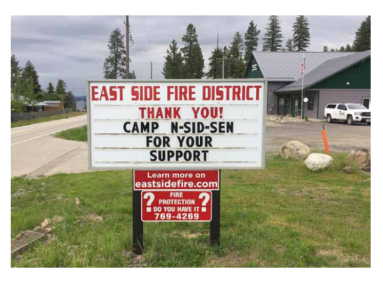
East Side Fire District and N-Sid-Sen have built a cooperative relationship over many ears.

"We have provided food for their July 4 pancake breakfast at the Arrow Point station, host