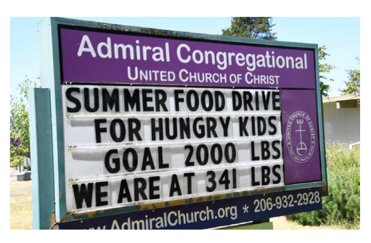
Readerboard draws food donations from the community.

congregations to collect food and money to support local food banks and children who need nutritional support during the summer.