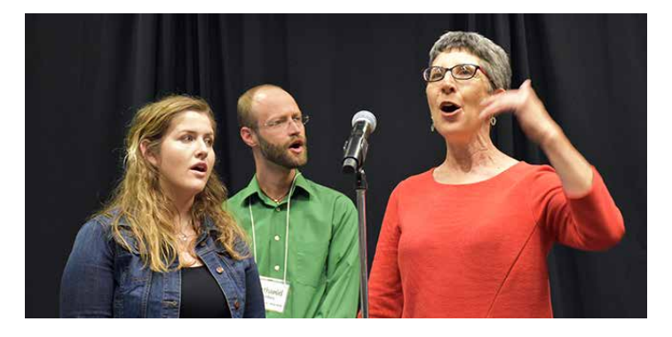
Walla Walla musicians and pastor lead song, "Break Forth."