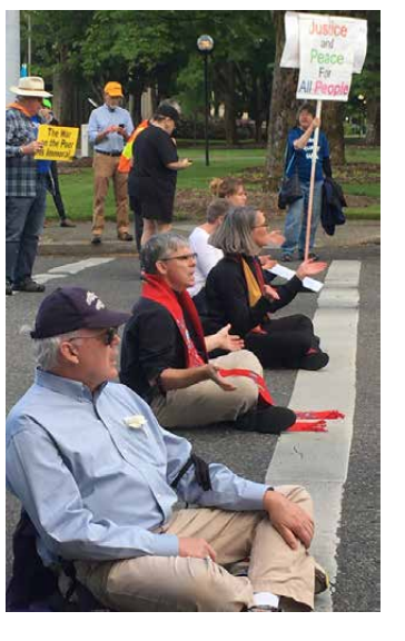
Protesters sit in street, top, testify, below, set up tents, bottom, and 25 are arrested on June 18, left.