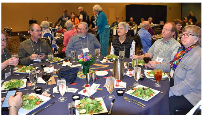
A chance for conversations at the banquet.