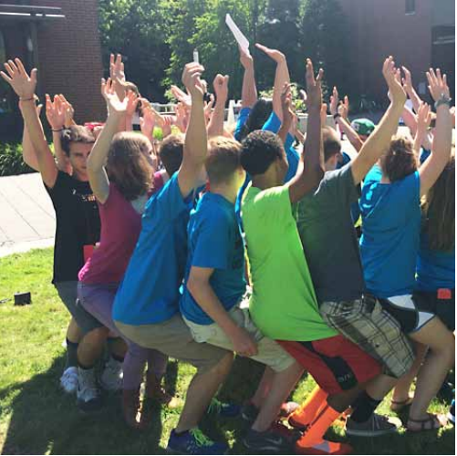
Youth join in games and activities to help them get acquainted with each other.

For information, email barbertara@hotmail.com.