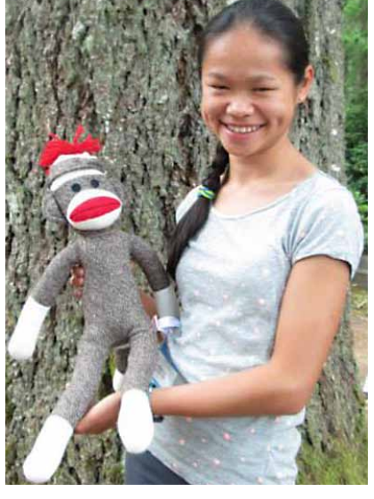
At Pilgrim Firs, Bob the monkey welcomed campers and was in many programs. Photos cour-