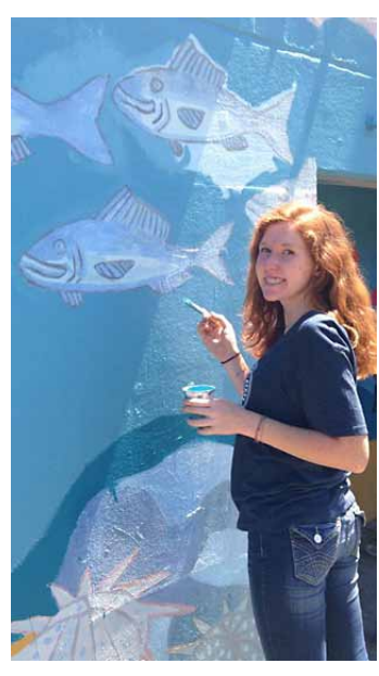
Youth painted a mural as part of a service project.