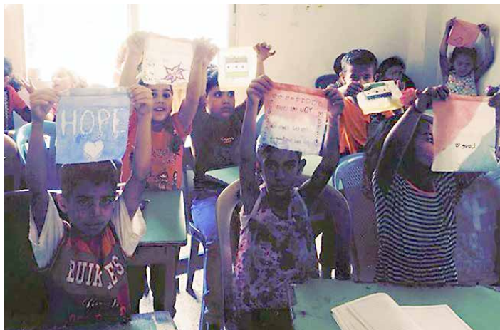
Syrian refugee students show flags they are taking home.