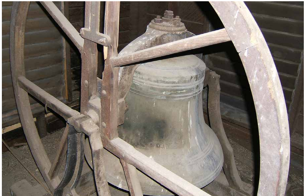
Dayton First Congregational UCC's bell was refurbished last spring before Easter.

Eells, who founded several Eastern Washington churches and schools, and Whitman College in Walla Walla, donated bells to nine churches: Colfax, Continued on Page 4