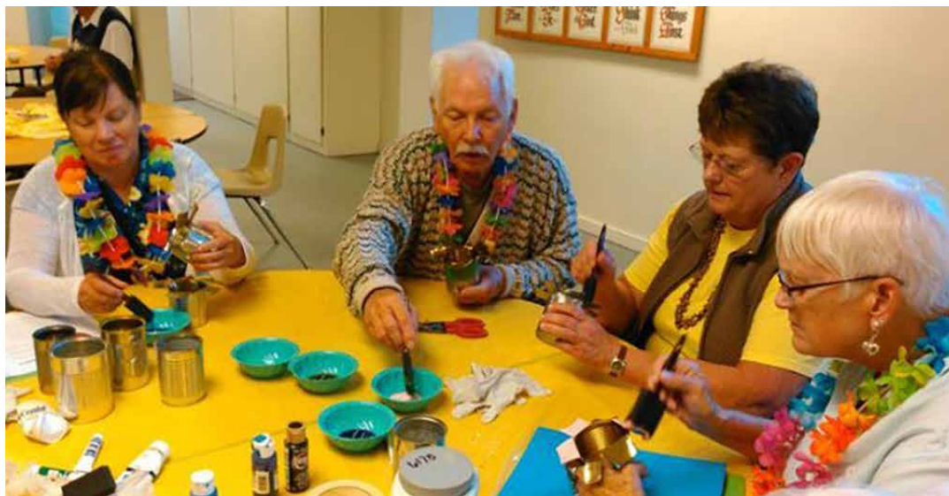
Adults do vacation Bible school crafts at Blaine UCC this summer.

Pastor Sandy presented various arts and crafts and each