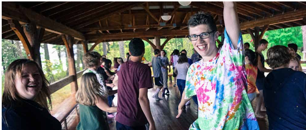
Senior high campers dance in the pavilion.