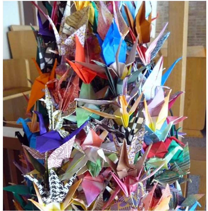
Covey of paper cranes brings love, strength and hope.

The liturgy to bless the cranes as they go to their destination says: “We send these peace cranes as a sign and testament to our hope for peace with justice in our world and our belief that violence does not have the last word. We send them carrying our love that it may en-