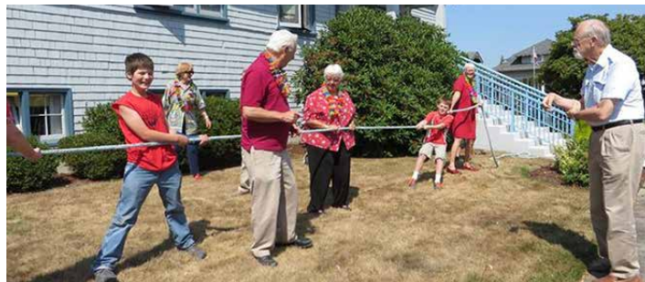
All ages participate in hukihuki outside the church building.

For information, email sandycheat@gmail.com .