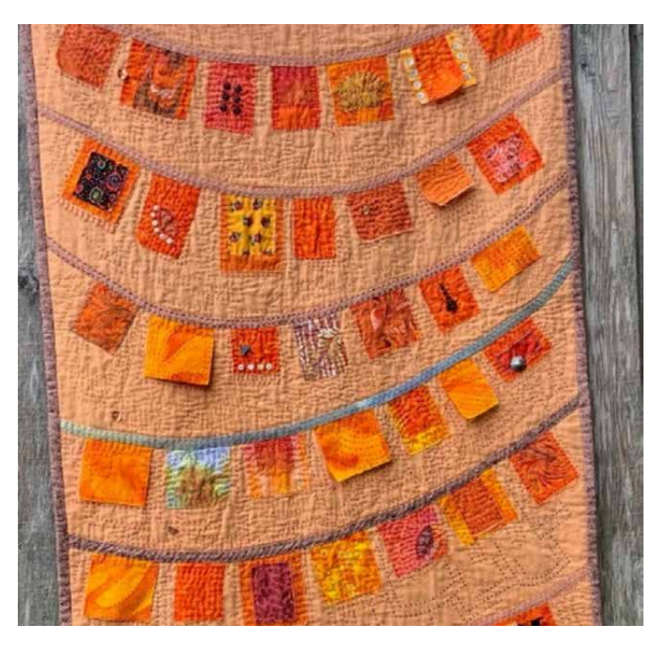
Orange shirt banners hanging in the UCC and Christ Lutheran Church in Ferndale.