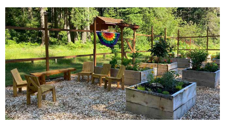
Pride Garden at Pilgrim Firs is the result of the work and donations of many people—cutting trees, making raised beds, planting rainbow colors of flowers, herbs, fruits and vegetables, and arranging them in a plot.